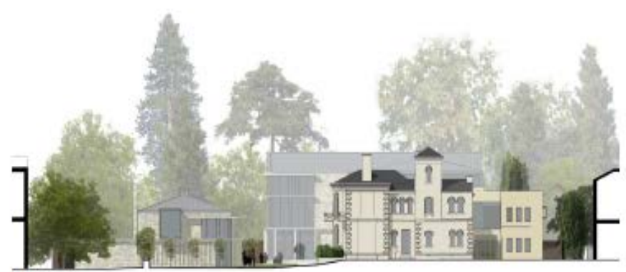
East Elevation 1:200