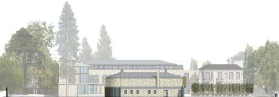
South Facing Elevation 1:200

Materials The walls of the new building will be finished in a light multi-coloured brick with fine pre-cast concrete detailing. The roofs will be finished in a dark grey zinc sheet material.