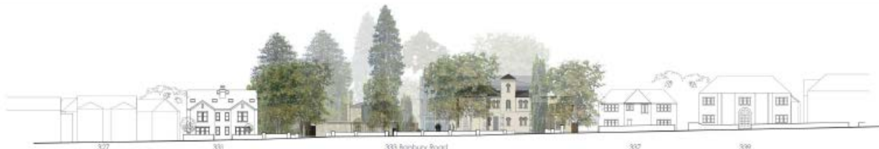
Banbury Road Street Elevation 1:250