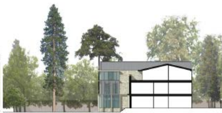
East Elevation 1:200

Materials The walls of the new building will be finished in a light multi-coloured brick with fine pre-cast concrete detailing. The roofs will be finished in a dark grey zinc sheet material.