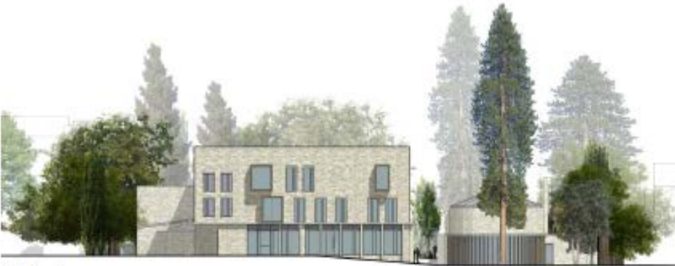
West Elevation 1:200