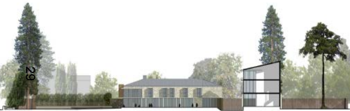
North Facing Elevation 1:200