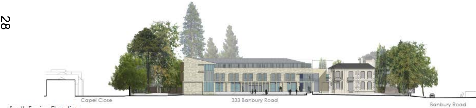
South Facing Elevation

North Facing Elevation Windows 1st Floor Laboratory Windows to have obscured glass up to 1.8m above floor level to prevent overlooking.