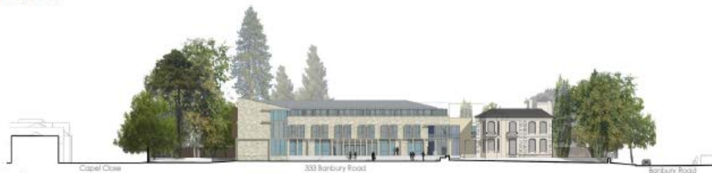
South Facing Elevation 1:250