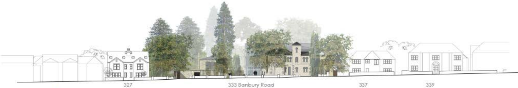
Banbury Road Street Elevation