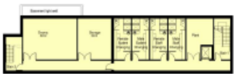
Basement Plan 1:200