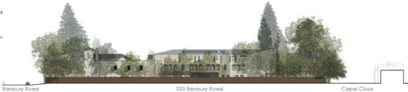
North Facing Elevation

1st Floor Offices to have projected timber boxes which allow for views to Banbury road and restrict views to neighbour gardens.