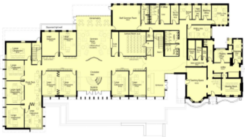
Ground Floor Plan 1:200