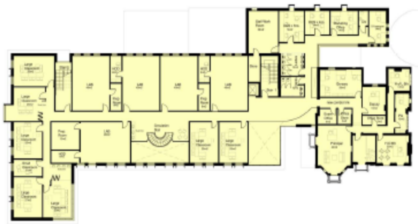
First Floor Plan 1:200