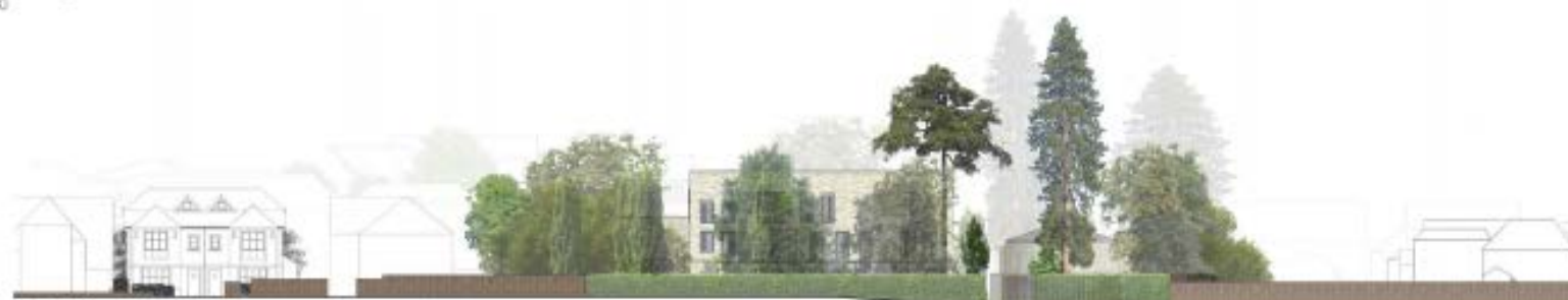
Capel Close Street Elevation 1:250