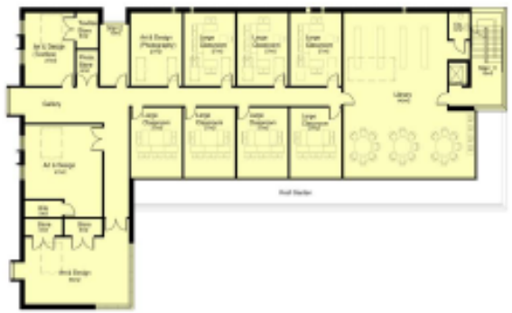
Second Floor Plan 1:200