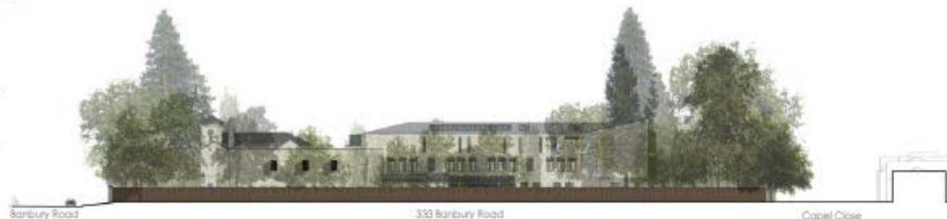
North Facing Elevation 1:250

1st Floor Offices to have projected timber boxes which allow for views to Banbury road and restrict views to neighbour's gardens.